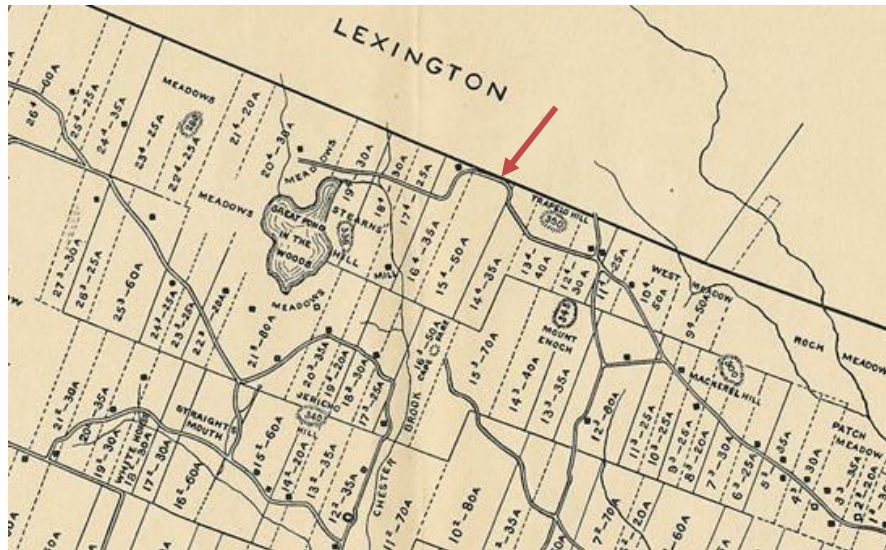
Site of Isaac Jr.'s Homestead current Bow Street in Waltham

"Isaac Stearns inherited in 1737 his father's homestead on Bow Street which was the old location of Trapelo Road." 11