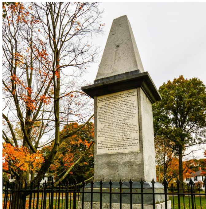
The Revolutionary War Monument

In 1835, the remains of the seven Lexington men killed on April 19 th were disinterred from their burial site in Lexington's Old Burial Ground and placed in a tomb just behind the monument. The monument is thus, both a gravesite and the first memorial in the country to the ordinary men who served and died in the cause of liberty.