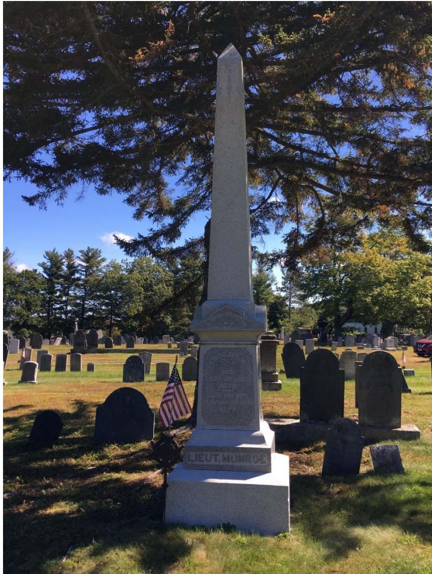
The base of the monument is inscribed LIEUT. MUNROE

There is an imposing monument in the Meetinghouse Hill Cemetery in Ashburnham marking the gravesite of Ebenezer and Lucy. 28