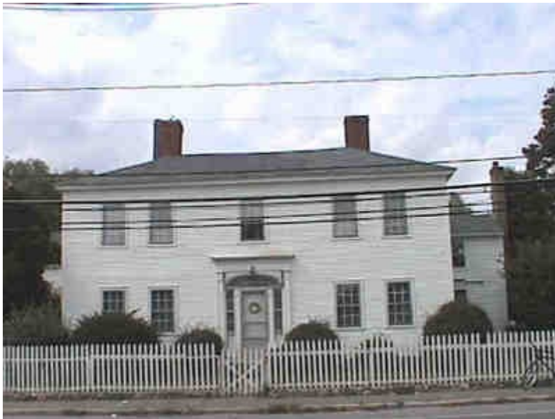
Present Day View of William Locke Home