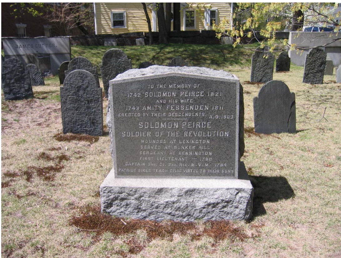
A 2006 photograph of the Solomon and Amity Peirce Monument (shown above in 1903) This headstone is located in The Old Cemetery on the corner of Massachusetts Avenue and Pleasant Street, Arlington, Massachusetts.