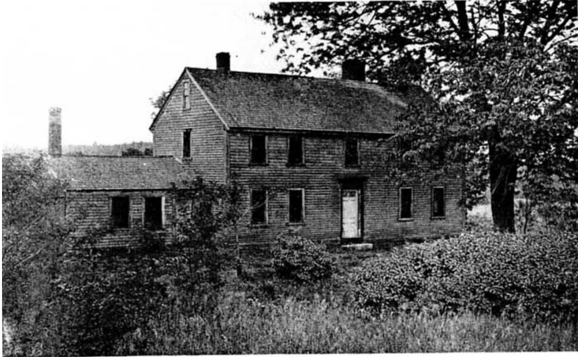
House occupied by Solomon Peirce from 1788 to 1803 or later

I have been unable to find the exact location on which this house stood, but it is certain that the house was located somewhere in what is now known as Arlington Heights, Massachusetts.