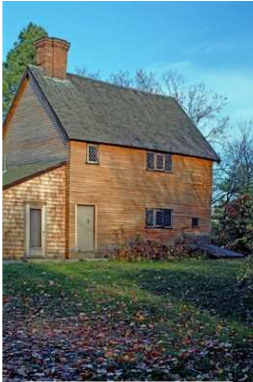
The Abraham Browne House