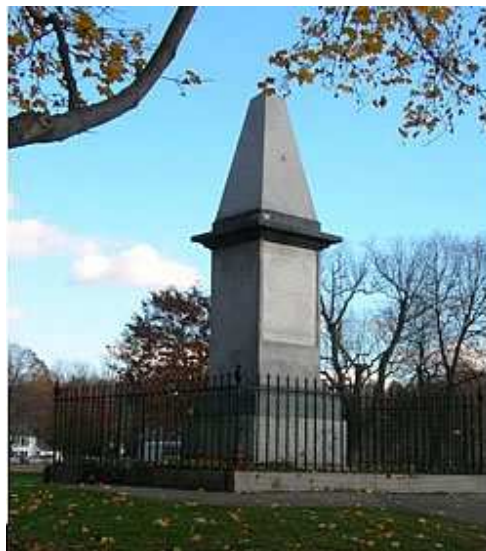
1799 Revolutionary War Monument

The 1799 Revolutionary War Monument is the first to be dedicated to the ordinary citizen-soldiers of the Revolutionary War. Underneath the monument lies seven of the ten Lexington men that were killed on April 19 th , 1775.